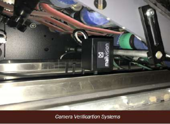
Camera Verification Systems

Small cameras available with self contained lighting, for tight areas.