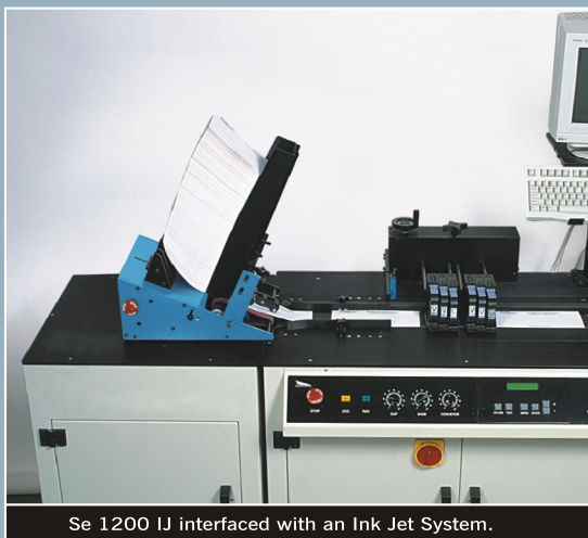
Se 1200 IJ interfaced with an Ink Jet System.