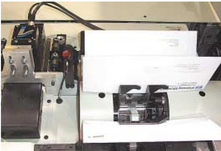
A MaxRead 3 mounted on the output of an inserter for inline integrity inspection.