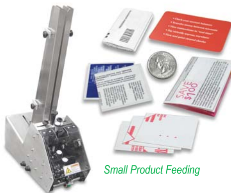
Small Product Feeding

From barcode reading to integrating a vision system for variable batch counting, we have your solution. We have developed solutions for automating products as diverse as multifolded pharmaceutical inserts to bound books.