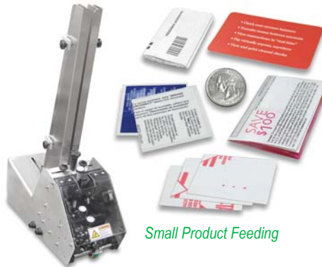
Small Product Feeding

From barcode reading to integrating a vision system for variable batch counting, we have your solution. We have developed solutions for automating products as diverse as multifolded pharmaceutical inserts to bound books.