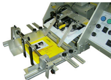
Batch-counting solution with XM-Series Feeders

The Standard Batching Tray (100899) is ideal for most products. For products that require a little more support due to lack of body, we offer an Extended model (100898).