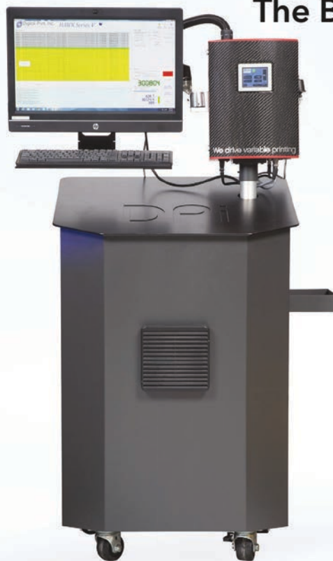
MOBILE CART OPTION