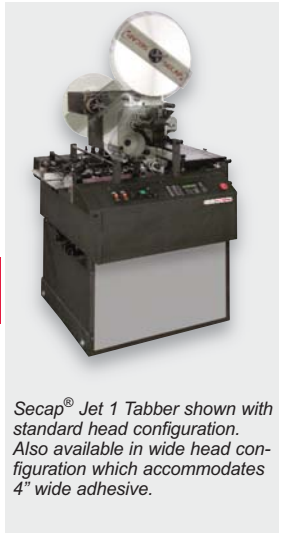
Secap® Jet 1 Tabber shown with standard head configuration. Also available in wide head configuration which accommodates 4" wide adhesive.