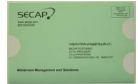
Shown: Sample booklet with toe and heel tab placement using 1½" tabs.